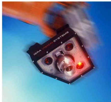
EASI3D: Location and position detection as well as adhesive and sealant inspection with one sensor